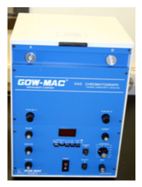
Figure 3: Gas Chromatography Instrument