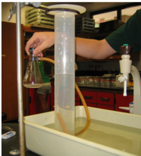
Figure 1: Gas collection set-up

You will need to collect gas by water displacement in order to measure the amount of \text{CO}_2 produced after the mixing of acetic acid and sodium bicarbonate in different molar ratios. Once you have determined the amount of sodium bicarbonate you will need to use in each reaction, conduct your experiments. Be sure to keep in mind the goals of the investigation.