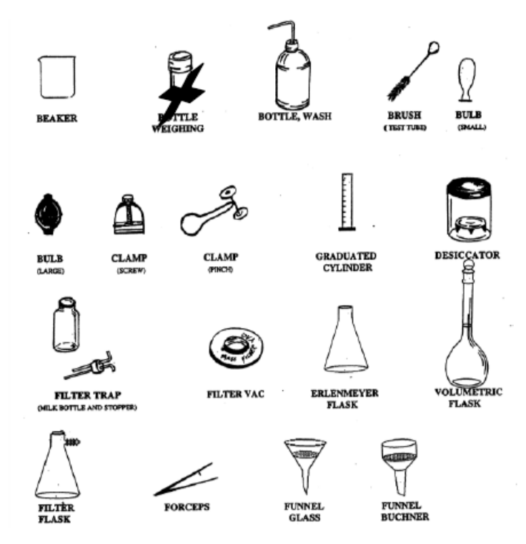
Figure 1: Items are not shown to scale